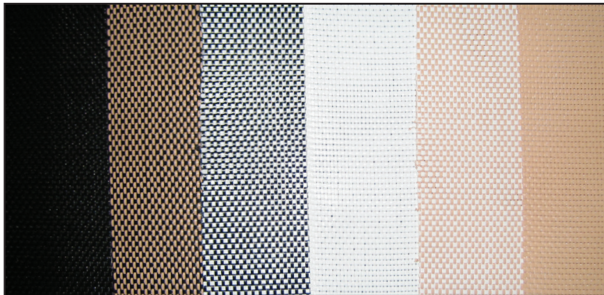
BLACK BEIGE/BLACK BLACK/WHITE WHITE BEIGE/WHITE BEIGE

TenCate Geosynthetics Americas does not assume liability for the accuracy or completeness of this information or for the ultimate use by the purchaser. TenCate Geosynthetics Americas disclaims any and all express, implied, statutory standards, warranties, guarantees, including without limitation any implied warranty as to merchantability or fitness for a particular purpose or arising from a course of dealing or usage of trade as to any equipment, materials, or information furnished herewith. This document should not be construed as engineering advice.